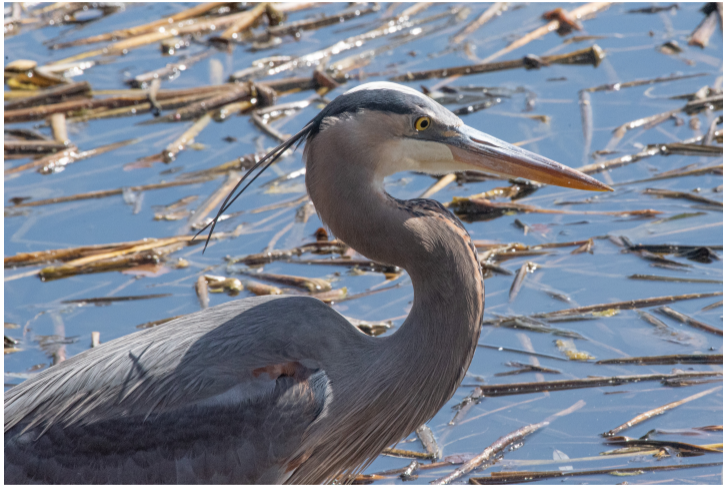
(Great blue heron, Central Park, March 23, 2021)