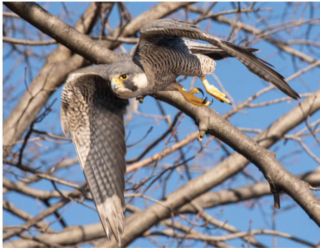
(Peregrine falcon, Central Park, January 26, 2022)